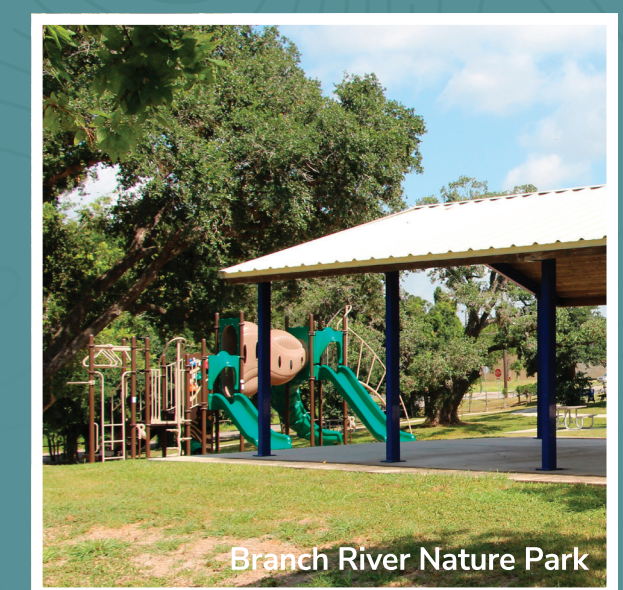
Branch River Nature Park

Many natural attractions bring visitors to Goliad. Branch River Nature Park links the historical and the wild with a good dose of fun! Grab a snack from Goliad's historic courthouse square and have a quick picnic under the heritage oak trees or test your skills on the 9-hole disc golf course.