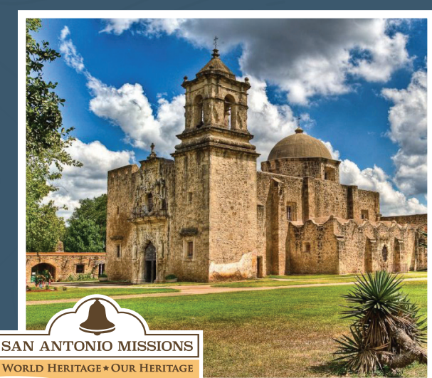
SAN ANTONIO MISSIONS WORLD HERITAGE • OUR HERITAGE

The headwaters of the San Antonio River are located in Bexar County. Archaeological excavations prove that the first human habitation along the San Antonio River occurred almost 12,000 years ago. The first documented arrival of Spanish explorers occurred on June 13, 1691, when members of a Spanish expedition named the river in honor of Saint Anthony. Throughout the 1700s, the development of what is now the City of San Antonio occurred alongside five Spanish colonial Missions established near the river. In 2015, the United Nations Educational, Scientific and Cultural Organization (UNESCO) inscribed the San Antonio Missions as a World Heritage Site.