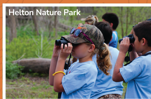
Helton Nature Park

Helpful links: Wilson County: www.co.wilson.tx.us Floresville: www.floresvilletx.com La Vernia: www.lavernia-tx.gov Poth: www.cityofpoth.org Stockdale: www.stockdaletx.org