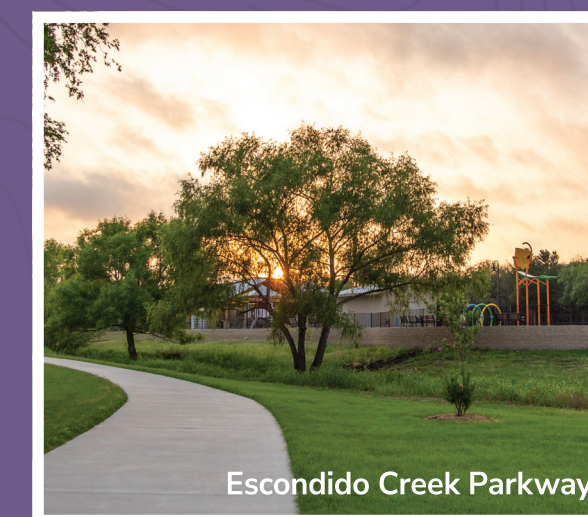
Escondido Creek Parkway

In the late 1700s, rich land and the San Antonio River's reliable water source led to the establishment of large ranchos in this area. Despite the presence of Fuerte de Santa Cruz del Cibolo, a fort located at Carvajal Crossing on Cibolo Creek, continuing conflict with Indigenous peoples forced the abandonment of many ranches.